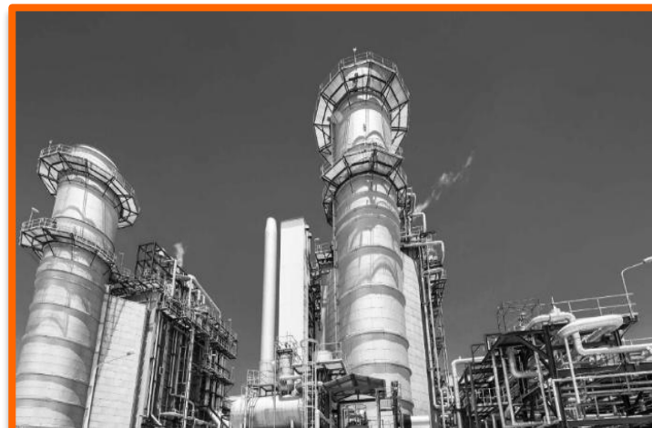
Chemical & textile industries