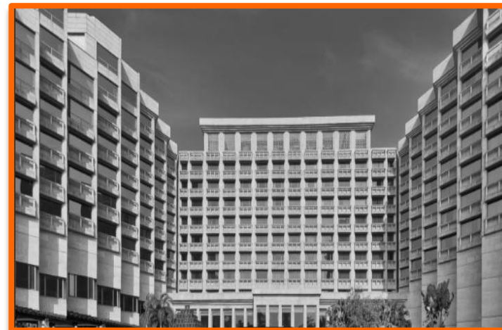
Hotels & hospitals using steam boilers