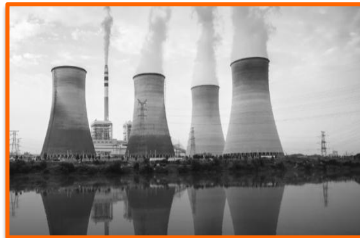
Power plants & refineries